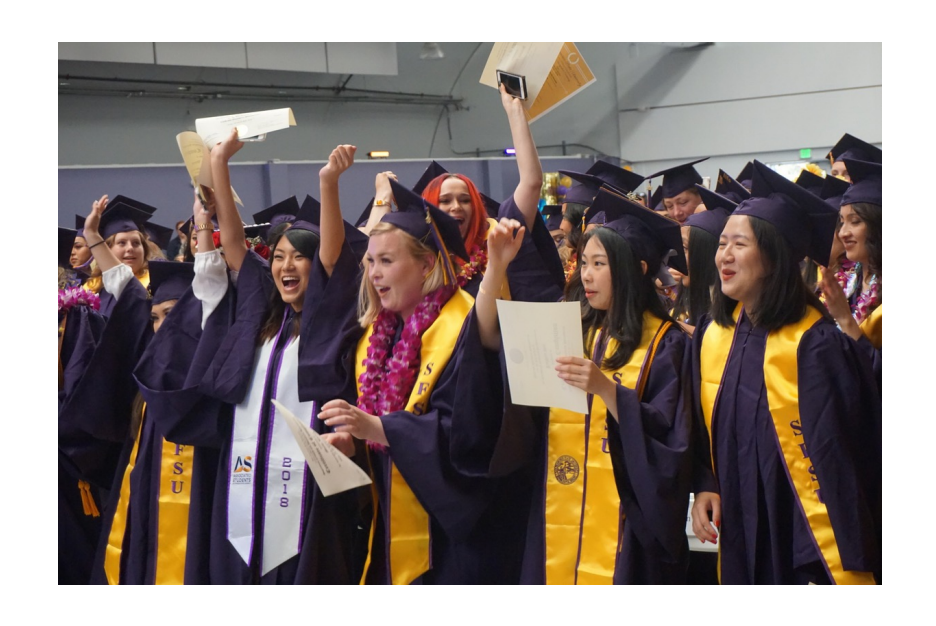
Child & Adolescent Development (CAD)